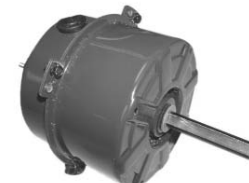
MultiFit™ Multi-Mounting System replaces: 4.33 BC Emerson Clam Shell BE Cap-Can