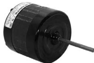
MultiFit™ Multi-Mounting System replaces: 4.42 BC AOS/Westinghouse Design Emerson 42-Frame