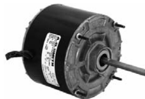
MultiFit™ Multi-Mounting System replaces: 4.62 BC GE 42-Frame Fasco 42-Frame AOS/Westinghouse Design