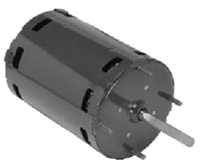
Fig. 5 R350 R409