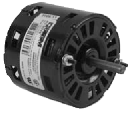
Fig. 7 R90573 R90752