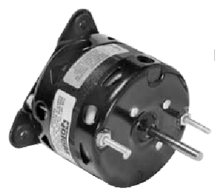
Fig. 6 R205