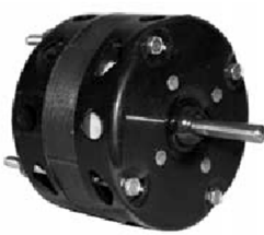
Fig. 2 R291 R319 R360 R362 R363