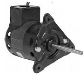
Fig. 8 R303