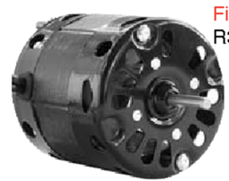
Fig. 3 R340