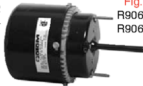
Fig.7 R90672 R90671