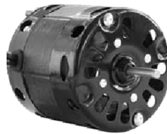
Fig.3 R336 R421 R355 R313