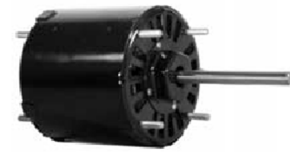
Fig.4 R358 R368 R1052 R90031 R90030 R90032 R90033