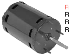
Fig. 5 R394 R356 R357